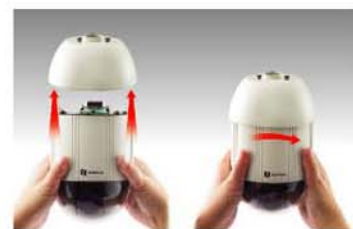
Plug & latch quick installation

With high pan/tilt speed at up to 240°/second, the EPTZ100 will capture any fast moving objects and all the actions so you don't miss a beat. The EPTZ100 also offer enhanced features such as privacy zone, noise reduction, pattern tours and many more, providing you with state-of-the-art PTZ surveillance.