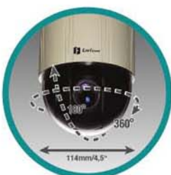
Compact size only 114mm/4.5" diameter