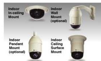
Support all kinds of mounting application